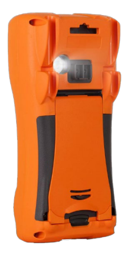
Figure 2. Ergonomically shaped with a built-in flashlight.

Designed for handheld users working in poorly lit environments, the U1240C Series fits comfortably in your palm, allowing you to single-handedly illuminate the test area with its easily activated built-in LED flashlight. With ergonomics in mind, you can swiftly make more measurements without straining your hands even over a longer period of time.