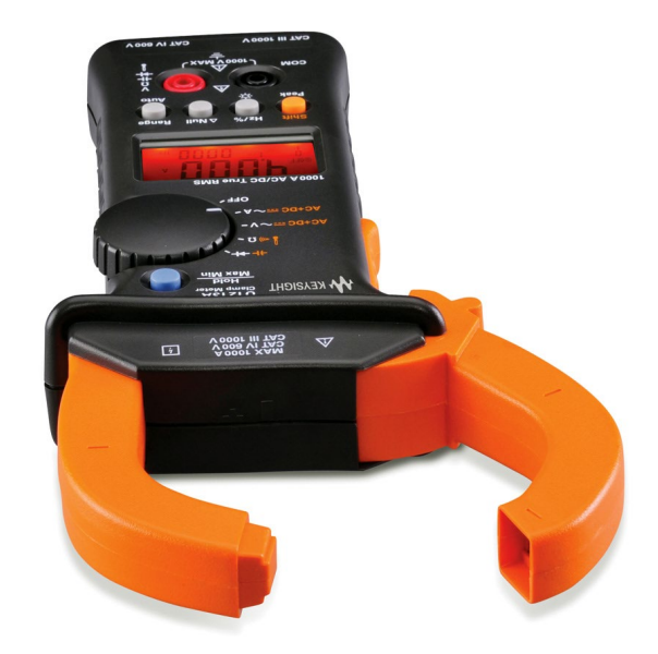
Figure 1. U1210 Series handheld clamp meter

Ensure that the clamp meter measures only one conductor at a time. Measuring multiple conductors may cause inaccuracy in measurement reading due to vector sum of the currents flowing in the conductors.