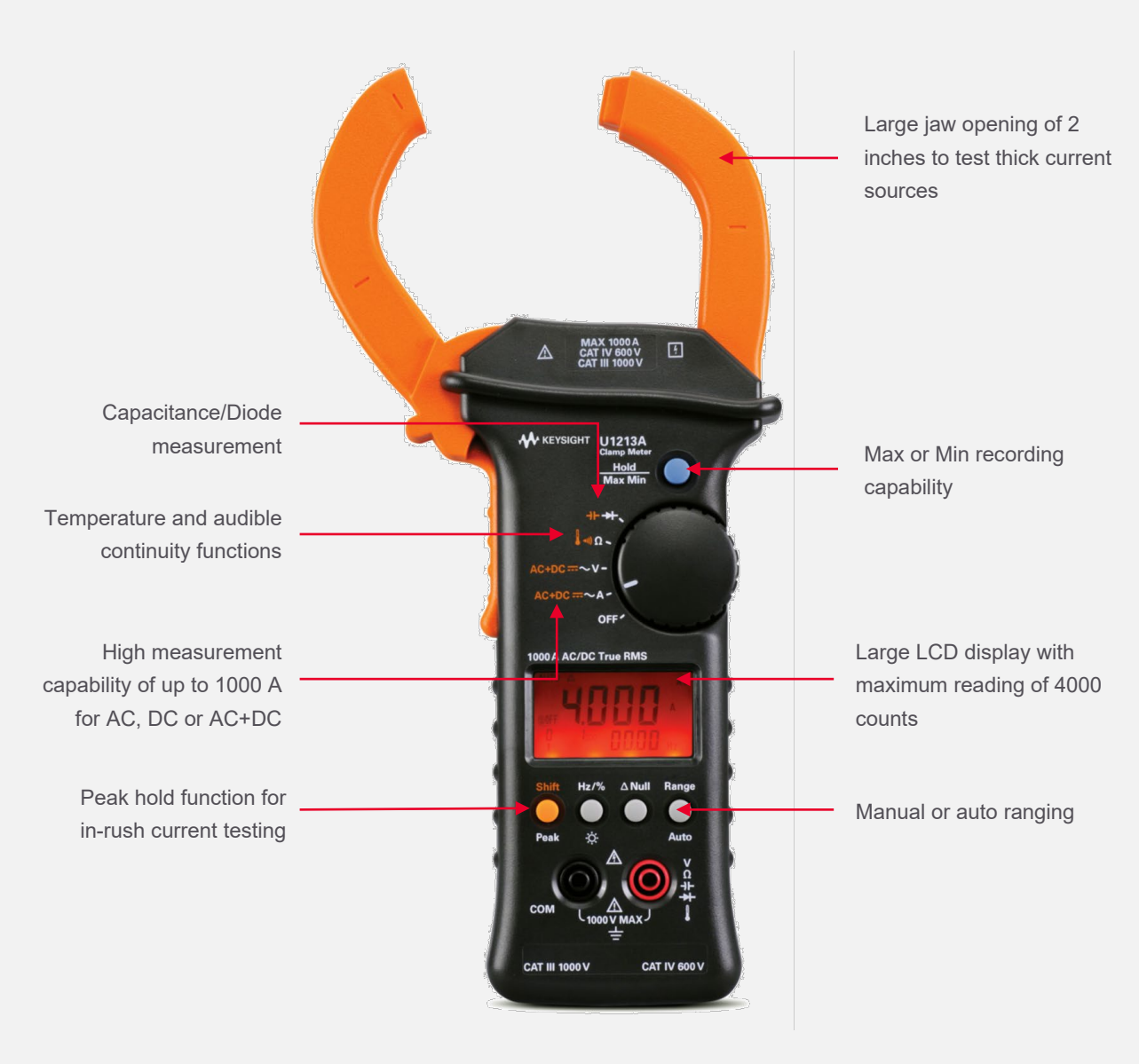
Figure 5. Front view of U1213A handheld clamp meter