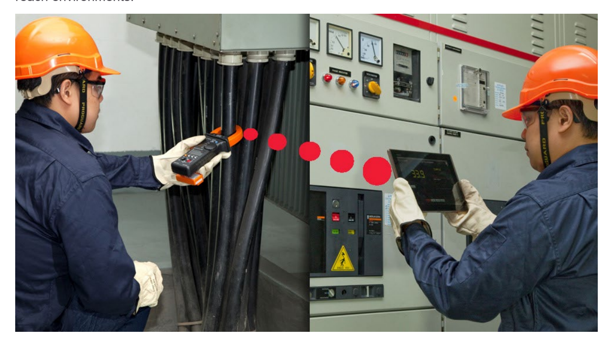
Figure 4. Monitor measurements and log data up to 10-meters range across all Android platform devices with the U1177A Infrared-to- Bluetooth adapter.

By adding the new Bluetooth capability to your existing U1210 series handheld clamp meters, you can make high current measurements more safely and conveniently. With the U1177A Infrared-to- Bluetooth adapter, you can easily monitor and log data up to a 10-meter range across all Android platform devices, providing an added benefit for maximum efficiency and productivity in a variety of difficult-to-reach environments.