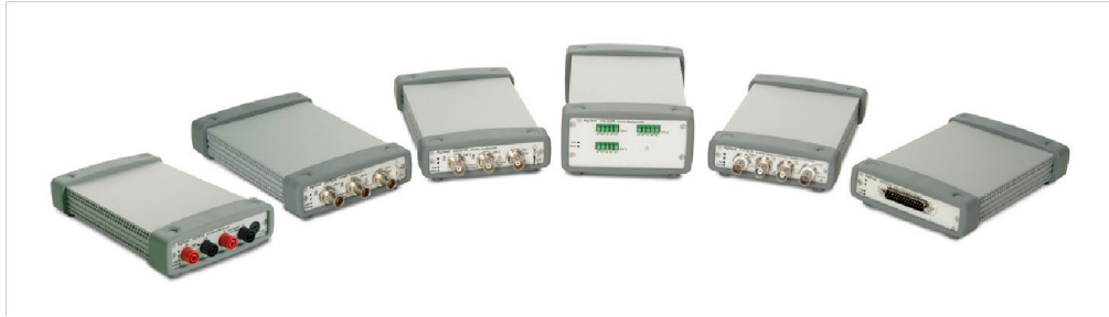
Figure 1. Keysight's USB Modular Instrument (MI) family

The next time you're called out to solve tough problems in electronic products or processes, leave the bulky transit cases behind. With Keysight Technologies, Inc.'s USB modular instrument (MI) family, you can easily carry powerful test gear in your bag along with your laptop PC. Our line of MIs includes two oscilloscopes, a DMM, a function generator with arbitrary waveform capability, a source/measure unit and a 4x8 switch matrix. All provide USB 2.0 connectivity (with USBTMC-USB488) standard and plug-and-play simplicity for easy use on the go or on the bench.