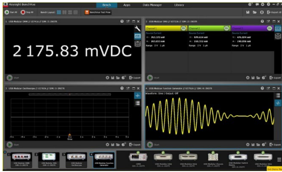
Figure 4. View measurements across USB DAQ, modular and bench instruments all on one BenchVue interface

The USB Modular Digital Multimeter App within BenchVue allows you to quickly configure and control the U2741A DMM to visualize measurements, perform data logging and annotate captured data. With BenchVue, you can display single measurements, charts or tables, from either a single U2741A DMM or multiple U2741A DMMs simultaneously to correlate trends you might otherwise miss. In just a few clicks, you can also record measurements and export results to popular PC-friendly applications such as Microsoft Excel and Microsoft Word for further analysis.