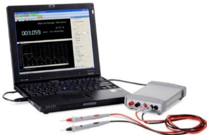
Figure 2. U2741A used as a standalone instrument